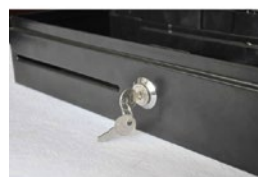
Lockable Cover of Cash Tray